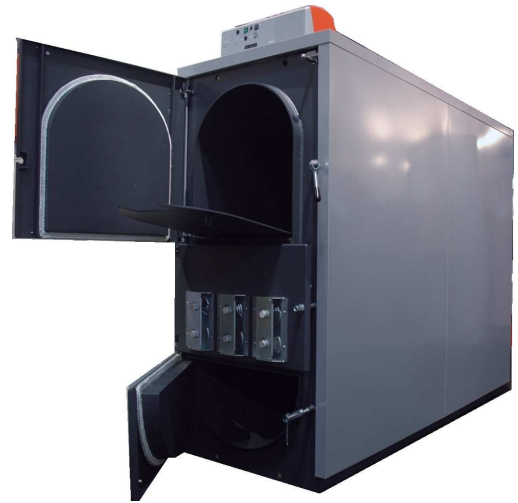
AIREX 150 - 200