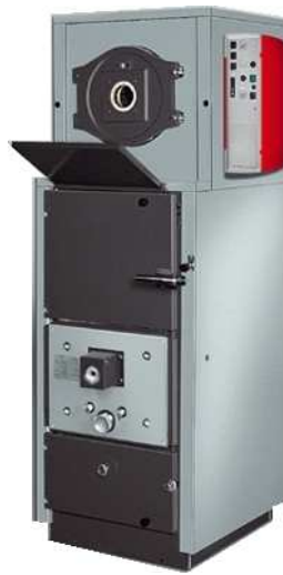
AIREX BICOMB FROM 25 TO 50