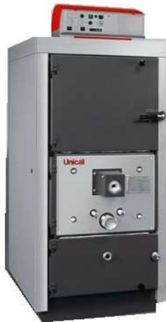
AIREX FROM 25 TO 80