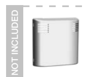
Room temp. sensor