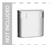
Room temp. sensor